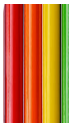
RAL on request